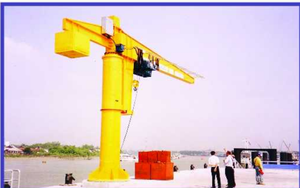
Slewing Jib Cranes