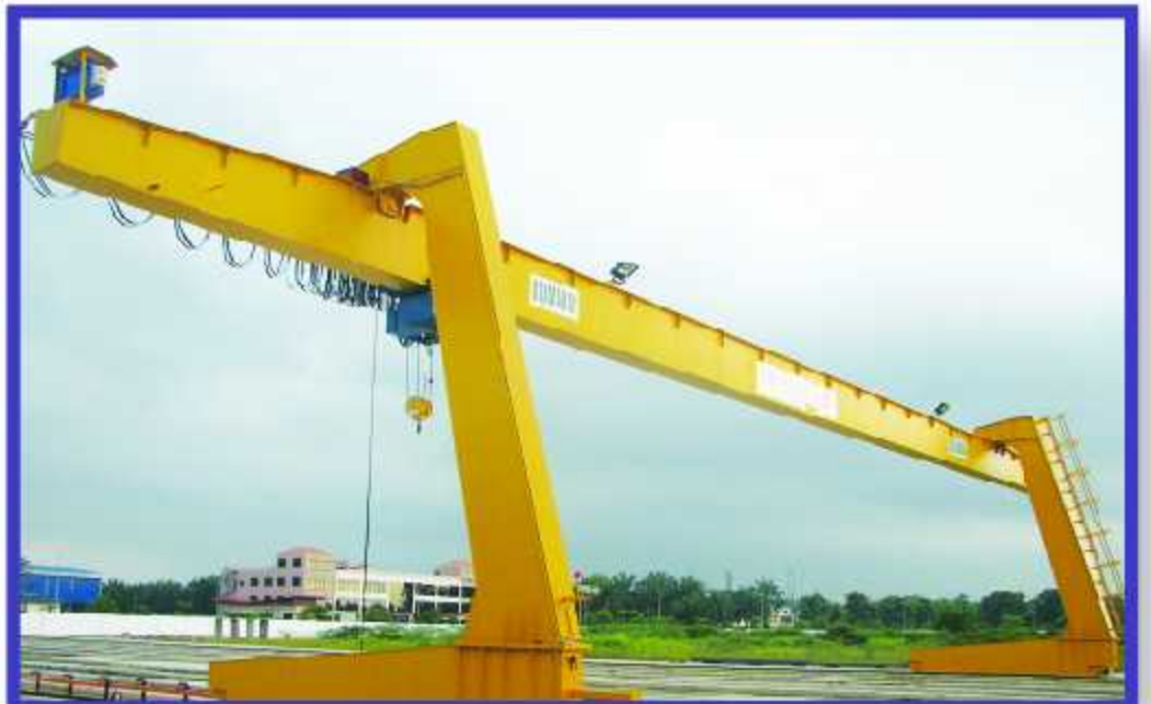
C-Shaped Gantry Cranes