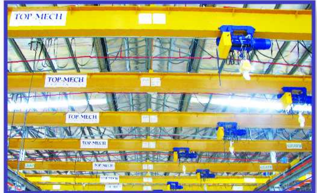
Single Girder Overhead Cranes