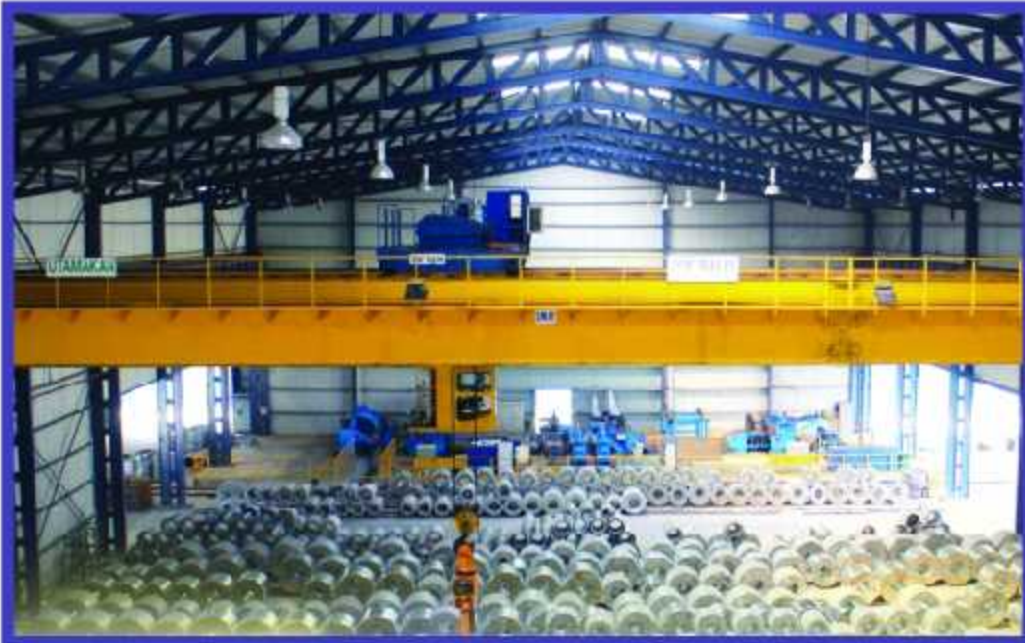
Double Girder Overhead Cranes