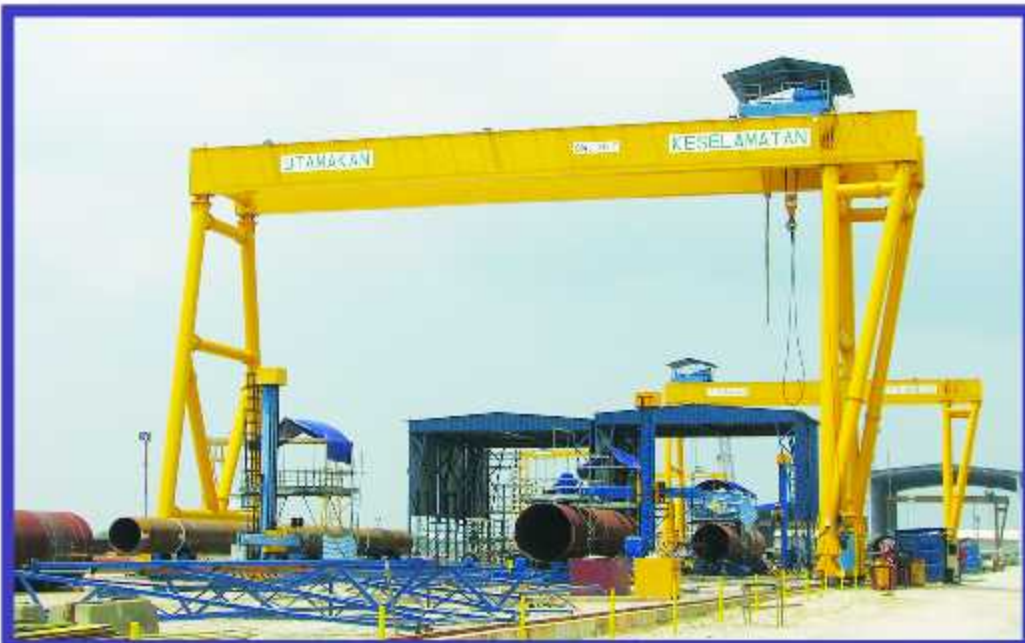
A-Shaped Gantry Cranes